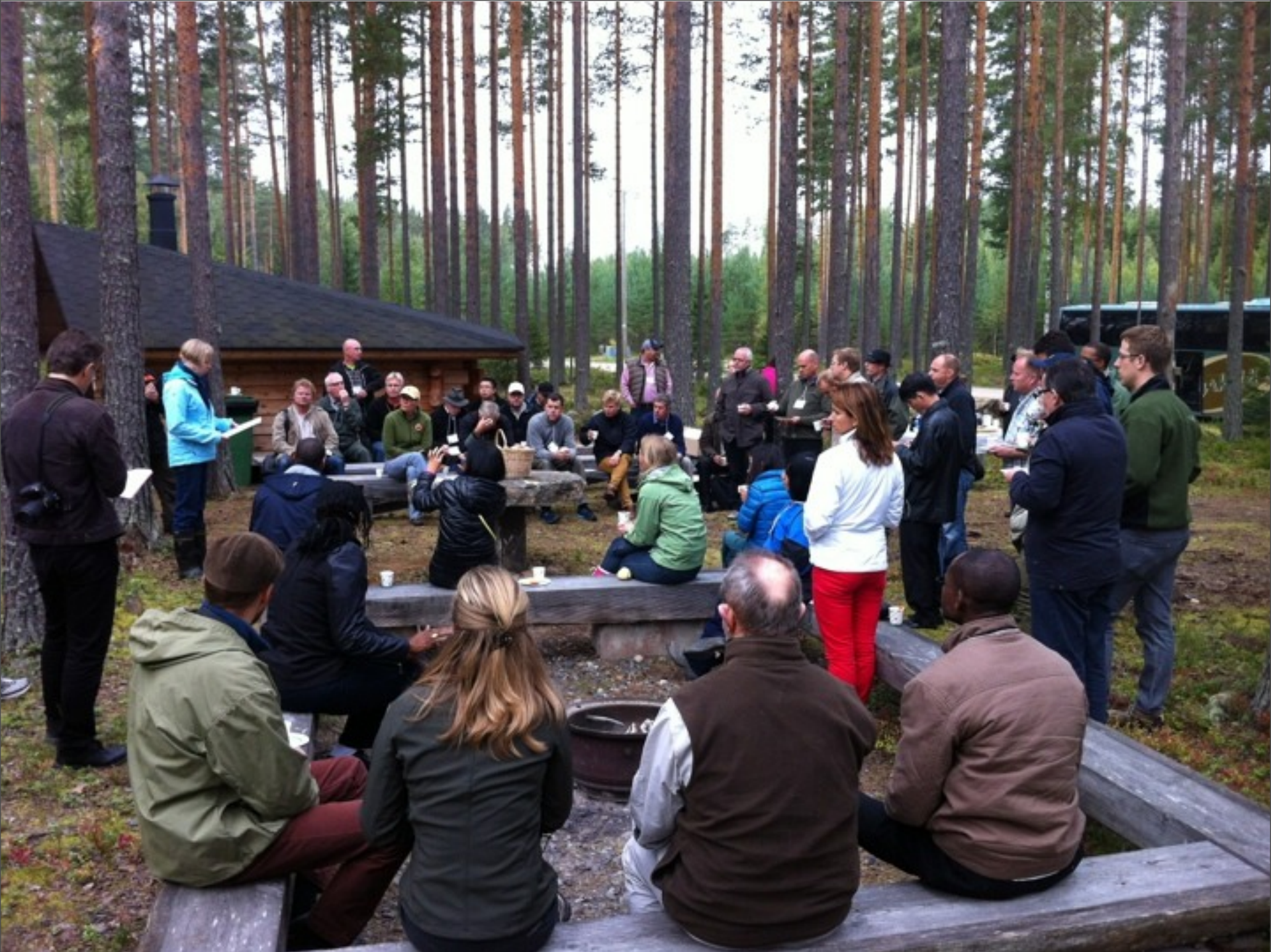
quinta-feira, 4 de setembro de 14