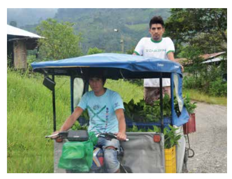
Transportation of the communities in the countryside

The REDD+ negotiations and the national REDD+ Readiness processes have indicated poverty as a main cause of deforestation and forest degradation. Thus highlighting the need to create benefit-sharing mechanisms for the poorest forest-dependent populations, and in this way, improving investment both in efficiency for forest management and in tackling this main deforestation driver.