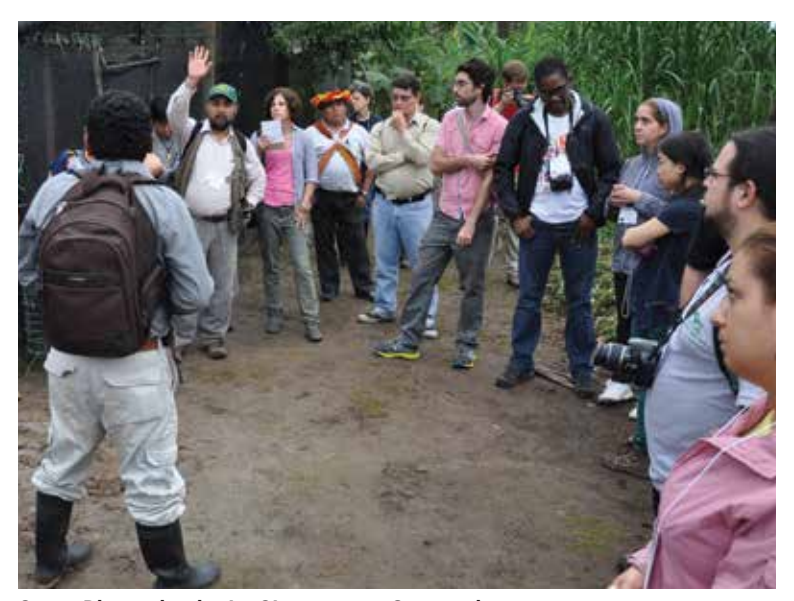
Group Discussion in the Shampuyacu Community nursery

The field dialogues consist of two sections: i) a field visit to a specific region related to the dialogue's subject, providing insights for subsequent discussions; ii) a series of participatory sessions where key issues of the dialogue are identified in the field and in the background document prepared for the dialogue were discussed and analyzed.