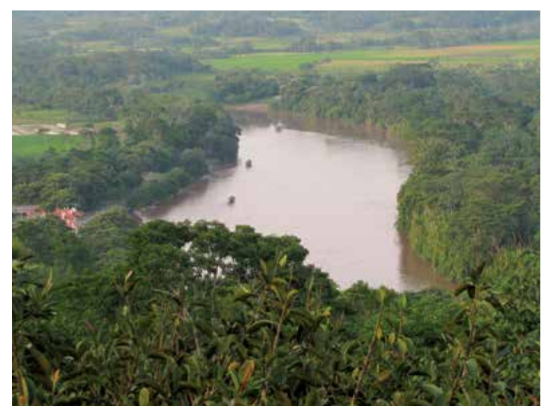
Río Mayo in the San Martin Region

Furthermore, the PNCB works with 48 indigenous communities that receive direct conditional transfers equivalent to US$ 3.80 per year per hectare for voluntarily conserved forest, over a five-year period. In general terms, this program could be considered a government payment for ecosystem services scheme that offers lessons for the design of REDD+ benefit-sharing mechanisms.