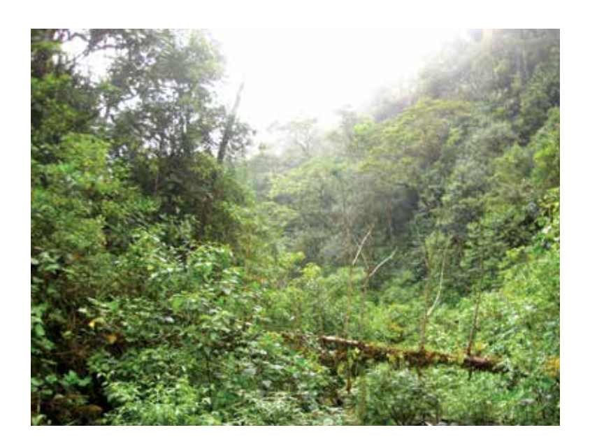
Alto Mayo Protected Forest