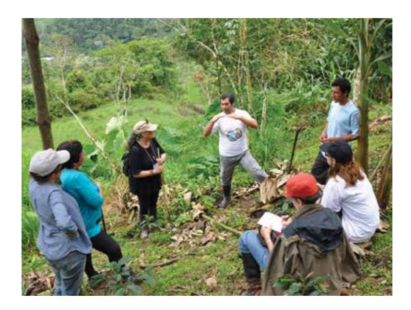
Visit to the Community Aguas Verdes

The main proposals suggested for addressing these complexities during REDD+ benefit sharing design and implementation are summarized as follow: