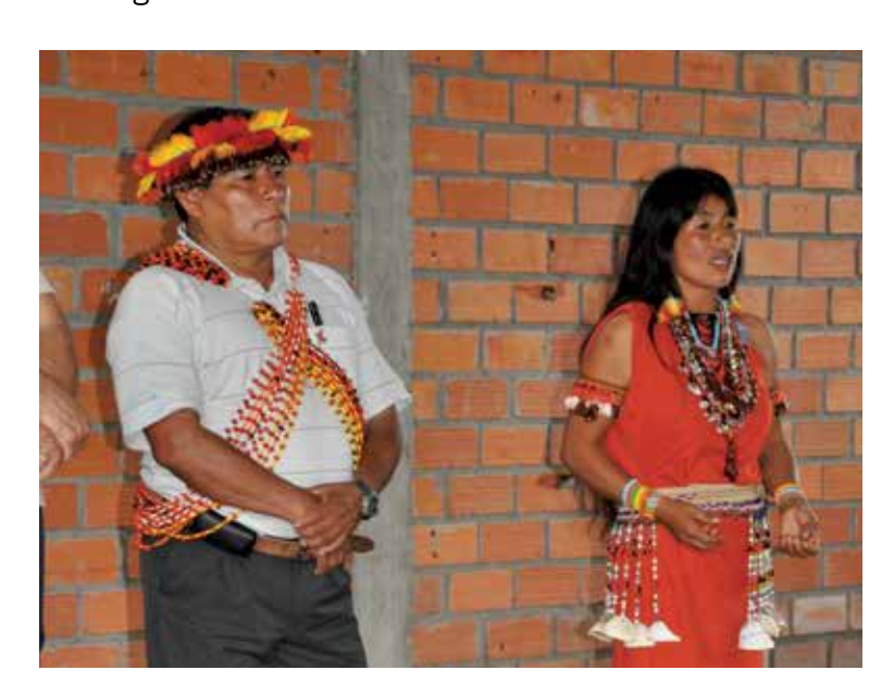
Shampuyacu Community Leaders