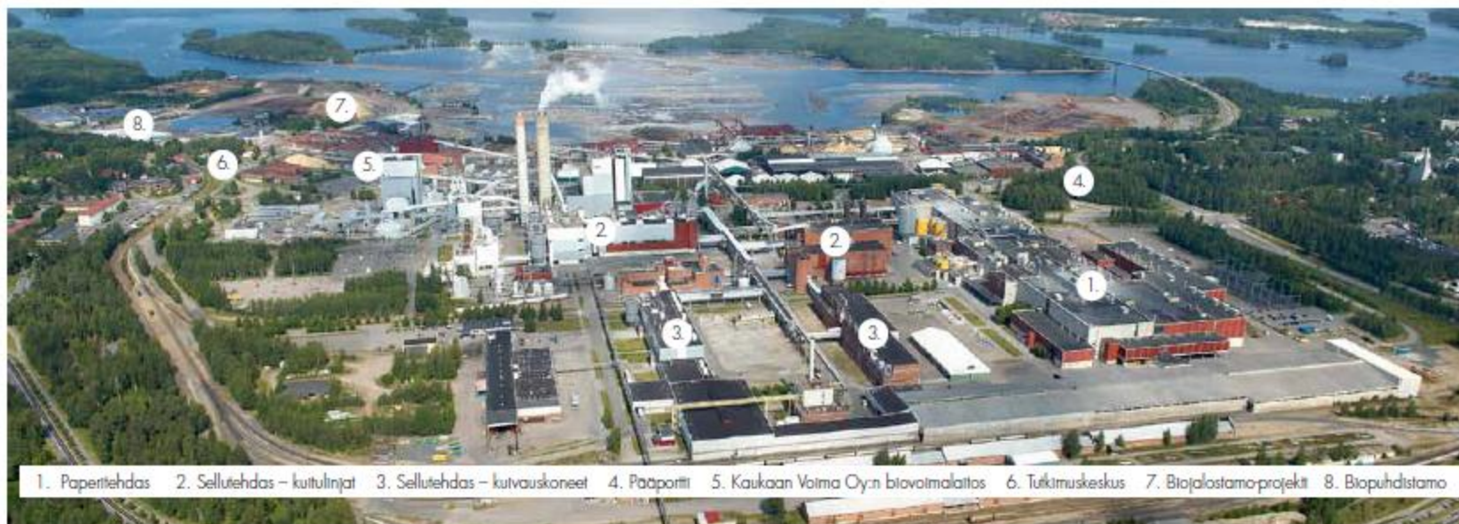
1. Paperitehdas 2. Sellutehdas – kuitulinjat 3. Sellutehdas – kutvauskoneet 4. Pääportti 5. Kaukaan Voima Oyj:n biovoimalaitos 6. Tutkimuskeskus 7. Biojalostamo-projekti 8. Biopuhdistamo