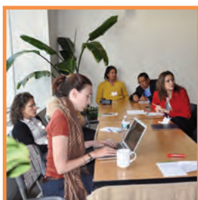
Discussion during a break out session