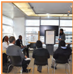
Group during break out session