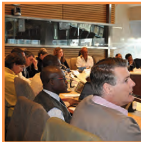
Group during plenary discussion

The costs for one stakeholder group can be the benefits received by another. In practice, it is not possible to minimize the costs for all but optimal solutions can be found through negotiations and compromises among stakeholders. It is important to understand the limitations of using opportunity cost indicators in managing the costs of REDD+, e.g., the difficulties in estimating opportunity costs where market is not well functioning and there is a lack of information.