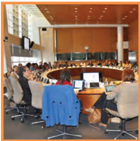
Dialogue participants during the plenary session

Some stakeholders believe that REDD+ will be able to leverage significant and sustainable new financial flows to developing countries mainly through payment for carbon and that fast-start REDD+ investments should focus on enabling conditions for emission reductions while safeguarding against social and environmental risks. Other stakeholders believe that there will not be sufficient or sustainable financial flows from payment for carbon and that REDD+ should be linked with development agenda to leverage other income streams; thus fast-start REDD+ investments should focus on no-regrets building blocks for green development and poverty alleviation with emission reduction as a “co-benefit”. But it remains elusive as to how REDD+ can be different from other existing development assistance programs and how to leverage additional funding if it is decoupled from performance-based payment for emission reductions. REDD+ may be able to bring transformational changes to the political economy of land use practices and deliver on both development and emission reduction. However a few stakeholder groups caution against “overloading” REDD+ with too many objectives while there are insufficient resources to support an integrated approach that can bring about the requisite paradigm shifts. There is a clear need for prioritization among different objectives.