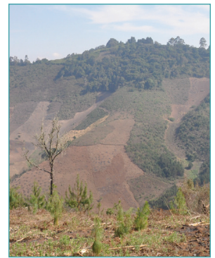
View of the landscape in Kilolo District