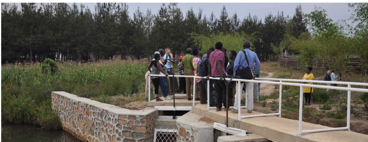
Dialogue participants visiting Mtula Irrigation Scheme