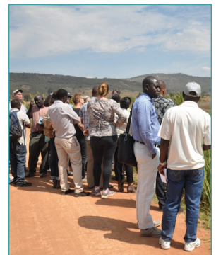
Dialogue participants observing the contrast between smallholder agriculture scheme and large scale commercial agriculture at Silverland Farms