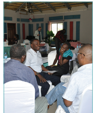
Dialogue participants during break-out group discussion