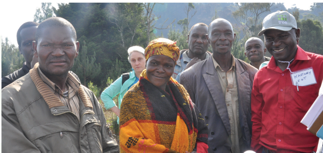
Smallholder farmers of the Kidabaga village land use committee in the field