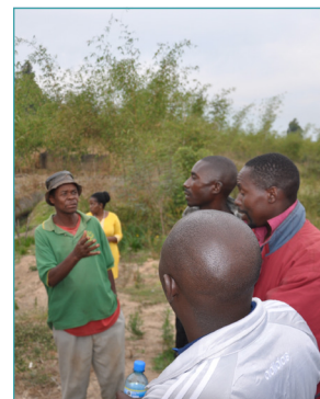
Discussion on water use and management at Mtula Irrigation Scheme