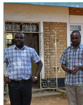
Land Officer at Mufindi District Council