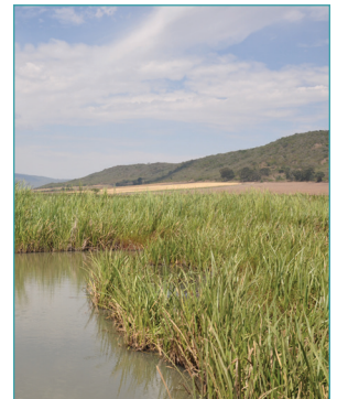
Large scale commercial agriculture at Silverland Farms