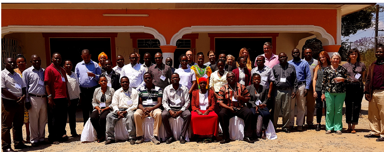
Dialogue participants in Iringa, Ihemi Cluster