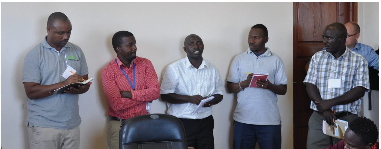
Kilolo District Land Committee explaining land use issues and village land use planning in the region

This Cluster, being part of the Great Ruaha River catchment, is characterized by a growing population, important wildlife conservation areas and highly productive irrigated agriculture downstream. Ongoing water abstraction for irrigation purposes and climatic changes likely to result in more frequent drying of the upper reaches of the basin. Just as the seasonal variability presents a challenge to rain-fed agriculture, the periodic drying of surface water is a challenge to building and maintaining irrigation systems that provide regular access to water for agriculture without threatening the needs of downstream water users. There is a need for upstream and downstream water users to negotiate on the proper water use mechanisms to keep great Ruaha river catchment sustainable.