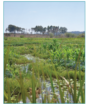
Wetland agriculture at Silverland Farms