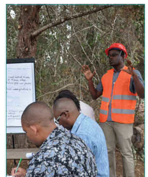
Tanzania Forestry Development Trustee presenting their demonstration site