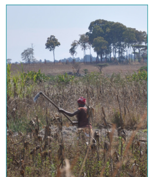
Smallholder farmer working at Silverland Farms