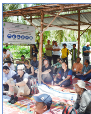
At the Amanah Association