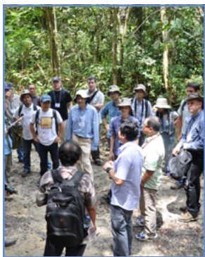
The group in the forest at the second stop