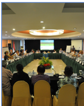
Dialogue in Pekanbaru

The field visits and stakeholder presentations informed a rich discussion that is grouped below into five thematic areas: defining deforestation-free; policy challenges; communities and smallholders; legacy issues; and scaling deforestation-free up.