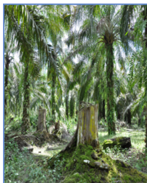
The oil palm plantation managed by the Amanah Association

beyond the spheres of indigenous communities and smallholders. Many communities still do not even know what ‘deforestation-free’ means; deforestation is a foreign concept to them, as they have always simply taken what they need from the forest. Participants suggested that there is a role for government to educate communities about deforestation so that communities can more effectively engage with companies whose operations impact them. It was also suggested that such engagements focus on deforestation ‘hot spots’ or high risk zones.