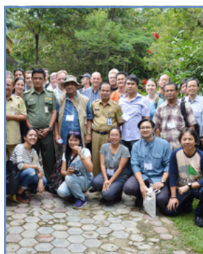
Dialogue participants in the field