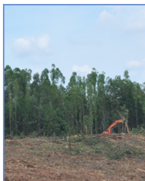
Forest clearing in Riau, Indonesia

The second site is a 42 ha forest within PT. Arara Abadi's 250,000 ha pulpwood plantation, which the company manages as one of a number of protected areas to help meet its minimum conserved area as required by law. The "arboretum" is open to the public for educational, research, and recreational activities, and is used as an elephant training facility. Although the company says it is available to local villagers for extraction of non-timber forest products (NTFPs) such as honey and fish, a leader from the Sakai community located thirty minutes away by car (see field visit #3) replied that he did not even know where the forest was located when asked about accessibility. This is not surprising given that the arboretum is an island of remnant natural forest surrounded by thousands of hectares of acacia and eucalyptus monocultures which feed the large, nearby Indah Kiat mill. Management challenges include encroachment by local villagers and forest fires, the latter of which the company works to mitigate through partnerships with local villages, which include provision of training and firefighting equipment to villagers. Encroachment to date has been limited; the management suggested that this was due to the fact that the forest is in the center of the plantation.