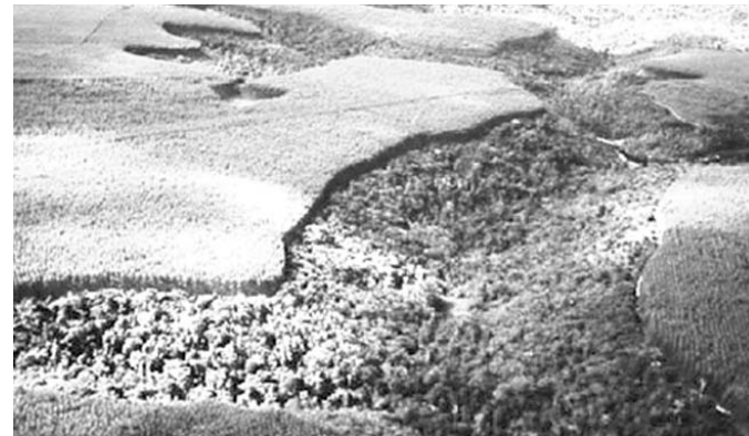
Example of Veracel's landscape management mosaic meshing plantations and natural forests

Among the key obstacles to adequate funding, investment, and other economic incentives for conservation are: limited human and financial resources; constraints on institutional capacity; uneven distribution of costs associated with conservation investments; lack of international rules allowing market trading of forest-based carbon offsets; certain regulatory provisions contrary to maintaining and enhancing endangered species populations; limited consumer demand for certified forest products sold at premium prices; tax policies unfavorable to sustainable forest management; and lack of a common vision for allocation of resources to high priority areas. Although "win-win" solutions are within