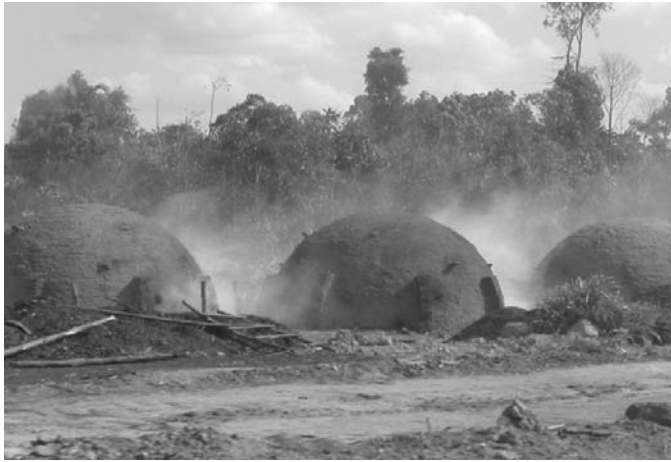
Roadside charcoal mounds

Meeting participants agreed that creative thinking and a willingness on all sides to try different approaches can help break through traditional "gridlock" and produce outcomes satisfactory to all stakeholders. There is a need to devote time and attention to building trust and capture lessons from successful collaborative processes that have yielded measurable conservation outcomes. Consensus recommendations coming from diverse stakeholder alliances can be influential in shaping policies that are beneficial to business and biodiversity, and in supporting politically favorable outcomes.