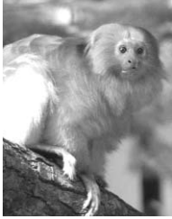
Golden Lion Tamarin

Pressures are mounting on the world's forested land base to meet society's needs for wood and paper products. At the same time, scientific understanding and public concern is mounting over the biodiversity impacts of global forest destruction. Deforestation trends are particularly acute in the tropics, where only about 45 percent of the world's original extent of tropical rainforest currently remains, and these forests are being lost at a rate of about one percent per year.