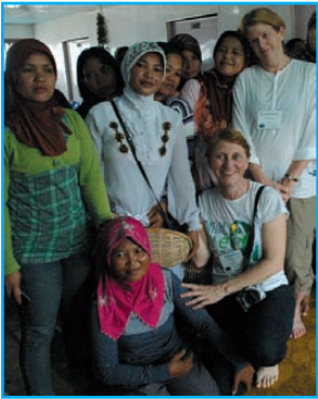
Group picture with Teluk Meranti community

Under ideal circumstances communities consult with all members and achieve consensus before entering into agreements. However, the reality is that many communities are class, caste and gender divided and, as noted, many communities now include numerous migrants who may observe different customs and have different expectations and values. Participants asked, what constitutes agreement if consensus is not achieved. It was suggested that all parties need to agree, in advance of a vote or decision, what mechanism the community will observe to ascertain whether there has been consent. It was noted that many indigenous peoples often do have internal regulations to resolve such disputes and it is only when outsiders take advantage and highlight differences that the internal rules break down and divisions are unnecessarily heightened. Likewise community engagement is needed to ensure that inclusive mechanisms involve marginalised sections of communities.