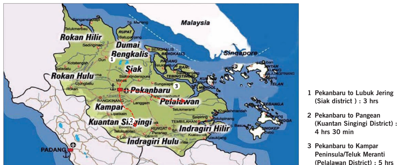
FIG 1: MAP OF TFD FIELD TRIPS IN RIAU, INDONESIA

are communities where there had been serious conflicts between plantation companies and local communities over land, but intensive efforts had been made to resolve the disputes. The third site of Teluk Meranti involved a plantation company which had committed itself to engage with a community respecting their right to FPIC and where efforts were being made to sequester carbon stores in natural forest and peatlands.