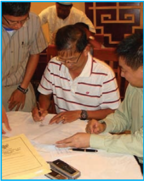
Signing of the agreement between the community of Pangean and Wilmar

The community of Pangean, where a large part of the nucleus estate was to be established on their remaining ulayat land, objected to the arrangement and took their concerns up with the local government. However this was ineffective. In 2004–2005 PT CRS was acquired by the Wilmar Group, but at first the local staff refused to address the communities’ concerns. In 2008 the community appealed to the NGO, Scale Up, for support and Scale Up arranged for a meeting between community representatives and Wilmar at the annual meeting of the Roundtable on Sustainable Palm Oil (RSPO), of which Wilmar is a member. At this forum Wilmar, which was under pressure from NGOs through a complaint they had made to the IFC’s Compliance Advisor Ombudsman, agreed to negotiate with the community and both parties agreed that Scale Up should mediate in line with RSPO Principles and Criteria, which require land acquisition with respect for FPIC and mutually agreed dispute resolution.