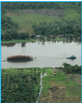
Lumber barge on a river bordered by acacia and palm oil plantations

For its part the community noted that Wilmar was only one of 13 companies with licences to operate on its lands of which only two including Wilmar had negotiated agreements with the community. The community noted that most companies have operated in bad faith and with impunity as the government does not recognize ulayat and promotes private sector led development. The community noted that given the choice they would have preferred to develop their lands with rubber but as they also prize harmony they had chosen to resolve their affairs amicably and maintain good relations with the companies and government. The importance of now getting the agreement between the company and community endorsed by the district and provincial government was seen as a priority. Some community members are sceptical that this will be achieved as this would imply government recognition of ulayat rights.