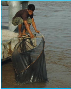
Fisherman from the Teluk Meranti community

The situation is exacerbated by the fact that the Indonesian government agencies have unclear responsibilities to address these issues. Not only do they develop land use plans without taking local communities' systems of land use and livelihood into account but decisions about land use allocations to the private sector are made without community participation. The common experience in Indonesia is that the government leaves it to companies to deliver basic services to communities and expects them to sort out conflicts with the communities.