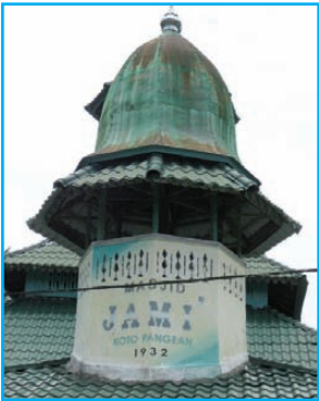
Local mosque in historic Pangean Village, erected circa 1400 AD

All the same, it was noted, even where best efforts are made to ensure scrupulous respect for the right to FPIC, the unequal power relations between communities and large companies enjoying government support for their projects, means that a fully level playing field is hard to achieve.