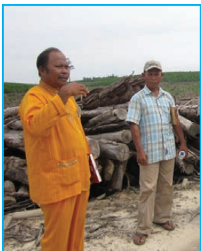
Local residents lead a tour of the acacia plantations in Lubuk Jering

In early 2010 the two teams were disbanded by the local government, and a new team with 40 members was created, based on a decree from the sub-district (Kecamatan),