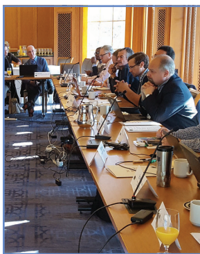
Opening plenary session of the scoping dialogue