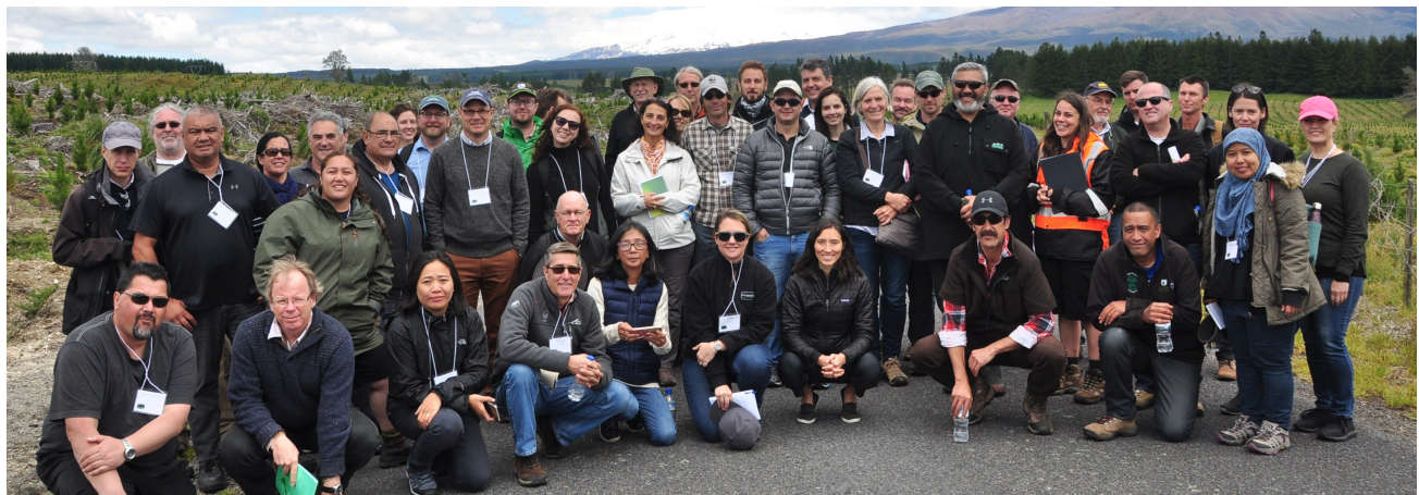
Dialogue Participants with Lake Taupō Forest Trust, Lake Rotoaira Forest Trust, and New Zealand Forest Managers in Houtōrangipo near Turangi

New Zealand has a unique emissions profile amongst OECD countries, reflecting the significance of the agricultural structure to its economy, and tree plantations make a major positive contribution to the national carbon budget. This is recognised in the national Emissions Trading Scheme, but the different treatment of agriculture and forestry under the ETS means that land use decisions are distorted in terms of ecosystem service contributions, and so that tree plantations do not make as great a contribution at a landscape scale as they might. We also saw and discussed in the field other examples of ways in which tree plantations could contribute positively or adversely to ecosystem services. These examples illustrated the importance of the landscape context, and of the management, of tree plantations in realising their potential ecosystem service contributions. The importance of an adequate and enabling policy framework, to effectively operationalise the concept of ecosystem services, was evident from all these cases.