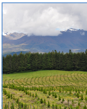
Lake Rotoaira Forest with sacred Mount Pihanga in the background