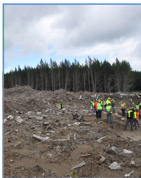
Participants visiting Timberlands Kaingarōa Forest