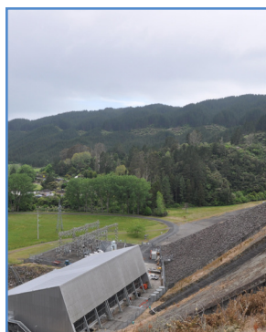
The view from the overlook at Matahina Dam, with Galatea township below