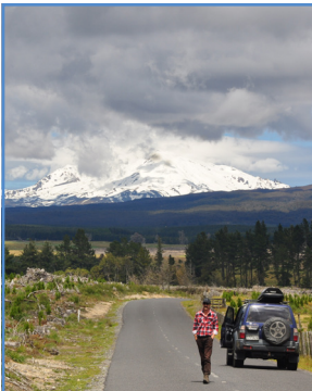
Bubs Smith (Lake Taupō Forest Trust) at Houtōrangipo, with Mount Ruapehu in the background