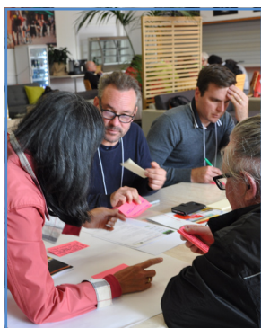
Participant discussions at Scion, a Crown research institute