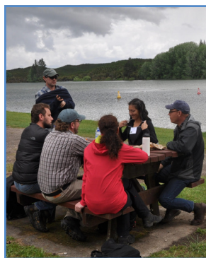
A lunch stop at Aniwhenua Lake