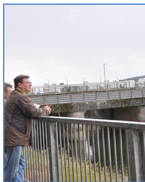
A field stop at Matahina Dam to see steepland forestry