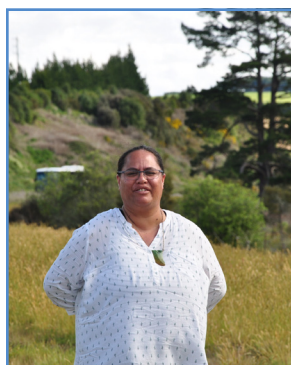
Leadership from Tauhara North No. 2 Trust explained the tribe's land use

we visited, in an era before the importance of such protection was recognised internationally, nationally or nationally, to set aside 30% of its land area for natural vegetation to protect watercourses and lakes.