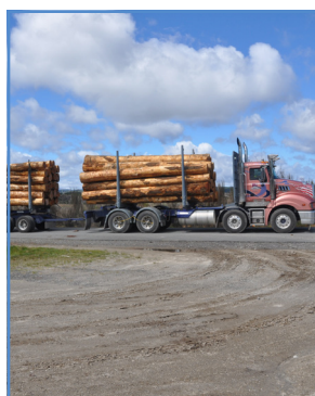
Logs being transported from Lake Taupō Forest