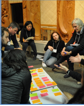
Participants inside Ihenga Whare (traditional Māori meeting house) on Tangatarua Marae at Toi-Ohomai, Rotorua