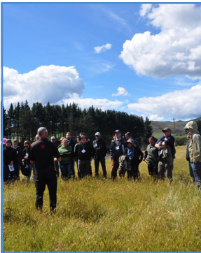
At the entrance to Nga Awa Purua and Rotokawa geothermal power stations with Tauhara North No. 2 Trust