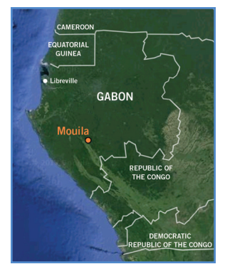
Map of Mouila, Gabon