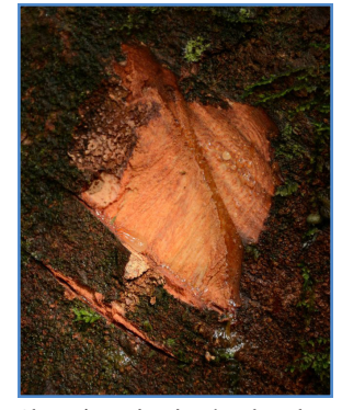
Okoumé wood and resin.