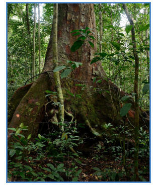
Okoumé tree (Aucoumea klaineana).