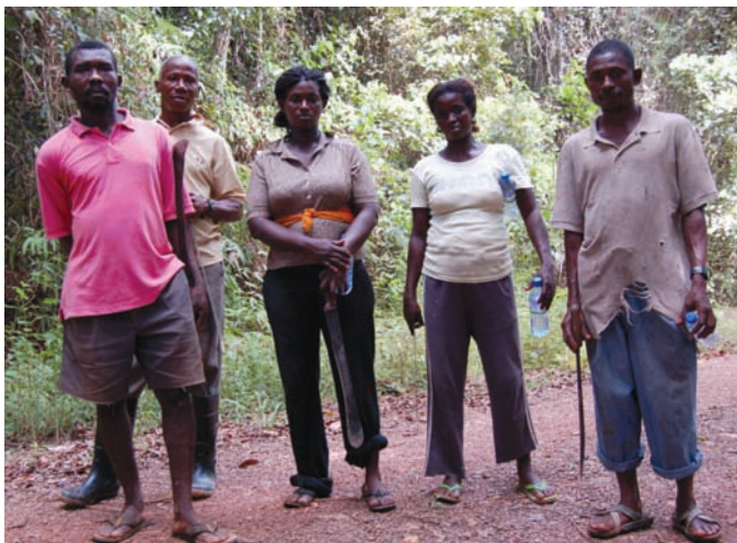
Forest workers in Ghana

Rights to land, trees and carbon. In many regions, disputes over tenure have persisted for generations and it is unlikely that all will be fully resolved in time for REDD+ implementation. In Guatemala, for example, issues related to property rights continue to stand in the way of improved forest governance, 15 years after the end of the civil war there. The fragmented nature of forests and overlapping claims contributes to tension and insecurity over land tenure and ownership.