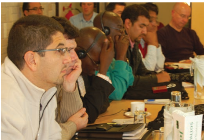
Plenary discussion in Ecuador

The next chapter further identifies the key challenges to be addressed during an enhanced phased approach to REDD+.