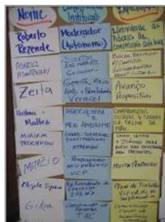
Participants expectations Panel on the third meeting

On the first presentation panel, participants shared their experiences from the partnership built up between companies and NGOs in the Vale do Rio Doce (MG), at “Mesopotâmia da biodiversidade” (a region situated between the Jequitinhonha and Doce rivers, in Southern Bahia and Northern Espírito Santo) and in the Vale do Paraíba and Capão Bonito (SP).