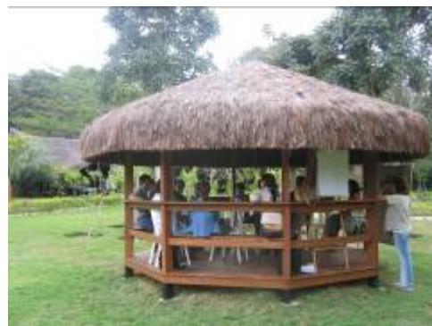
Territorial Planning working groups (on the left) and Tree Farming working group at the RPPN Estação Veracel.

The third day started with the presentation of the working groups' proposals, which were complemented by the participants who composed the working group that day. To finalize the meeting, participants discussed the achievements of the Dialogue so far, highlighting that the process was conducted in a manner that allowed continuous and